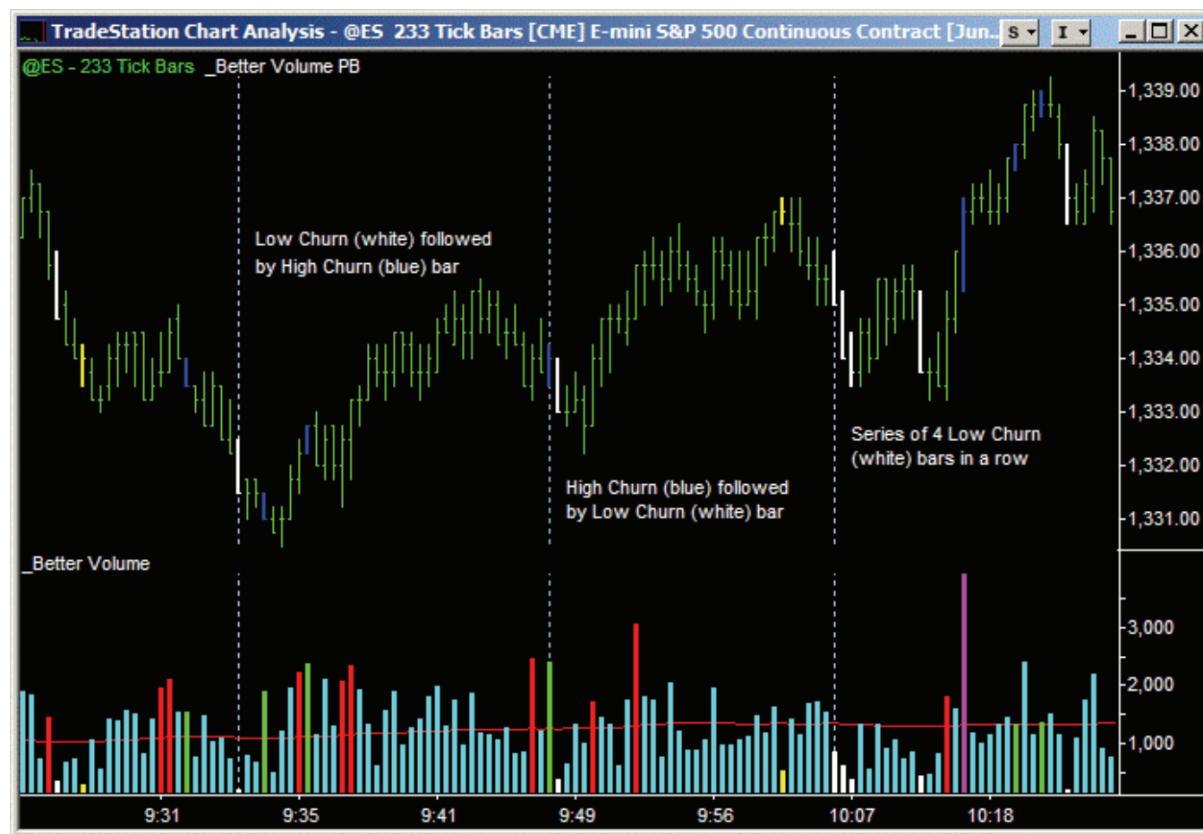
Volume Indicator: Market Bottoms

Market bottoms are characterized by Low Volume Churn, Low Volume and High Volume Churn. The most common pattern is the Low Volume Churn. This either occurs alone or with High Volume Churn or Low Volume bars.