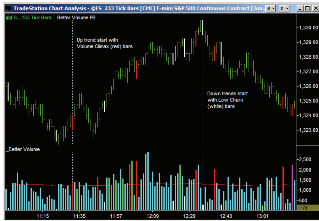
Volume Indicator: Start of Trend

The beginning of an up trend is almost always marked by a Volume Climax bar. This shows that the buyers are anxious to get on board and large volume enters the market and bids up prices quickly. A valid breakout should be followed by more buying but occasionally the low of the Volume Climax bar is tested.