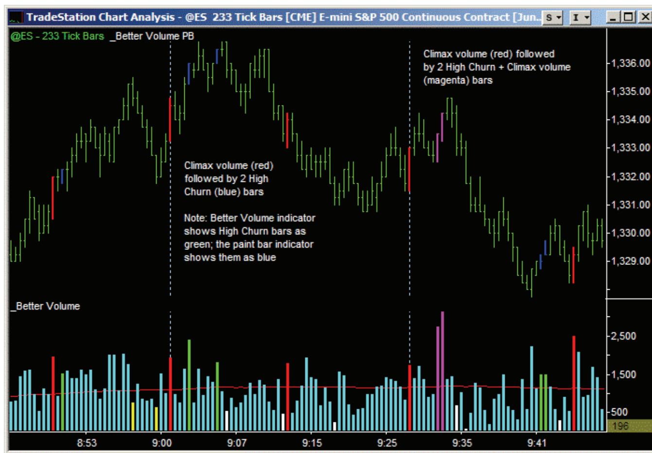
Volume Indicator: Market Tops

Market tops are characterized by Volume Climax, High Volume Churn and Low Volume patterns. The most common pattern is Volume Climax followed by High Volume Churn. Sometimes these patterns will occur in the same bar - and the bars are colored magenta. On other occasions the High Volume Churn bar will come first and then be followed by Volume Climax.